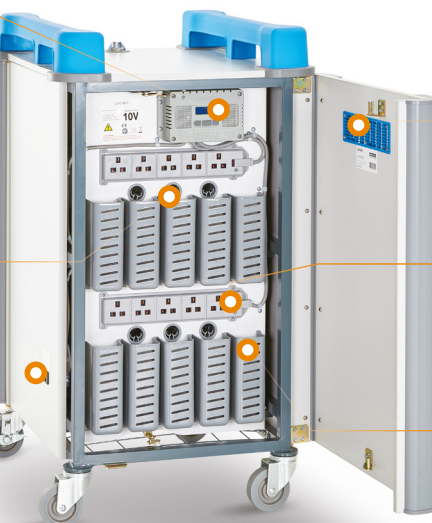
Well placed vents allow constant air circulation.