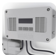
Power 7 Management System manages the power consumption.