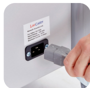
IEC socket with 1.8m designed to snap out if pulled away.