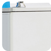
Strong MFC cladding.