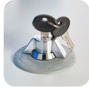
Dual point locking Key system.