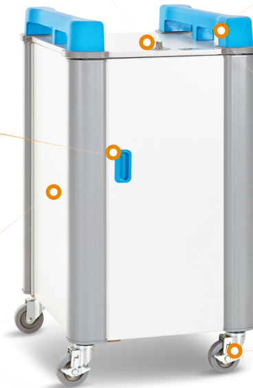
Ergonomic ABS handles.