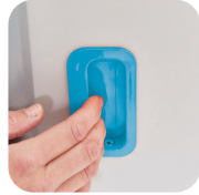
Inset door handles.