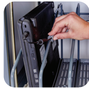
Perfectly designed cable clips to secure.