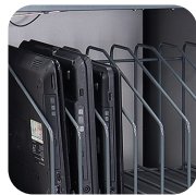
Devices stored vertically in individual compartments on sliding shelves.