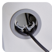
Cable clip portholes feed cables.